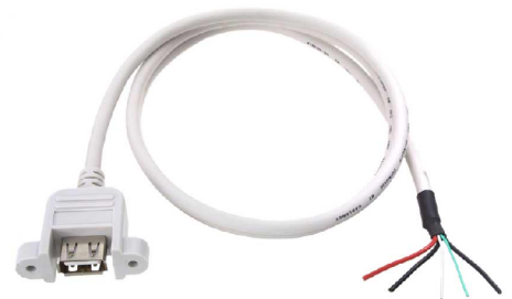
USB - I/O Cable - Series A Socket with Bracket to Null Assembly Part# RR-UR2-1001G

Contact info: www.USBFireWire.com 4432 N. Mission Wichita, KS 67226